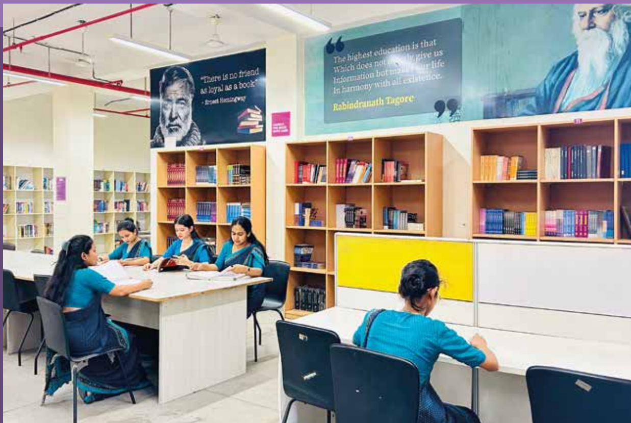
Nursing College Library