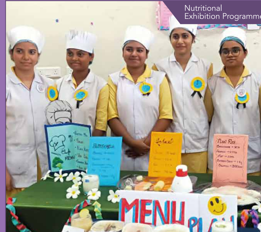
Nutritional Exhibition Programme