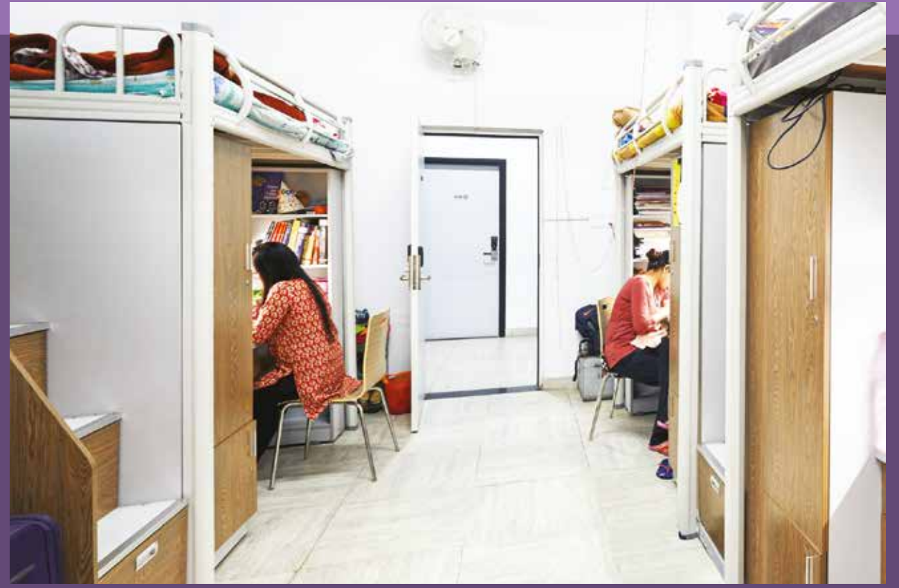
Nursing College Hostel