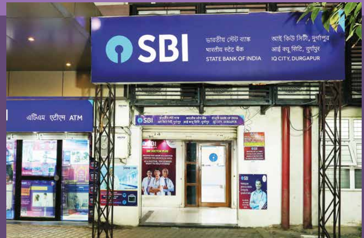
Bank and ATM